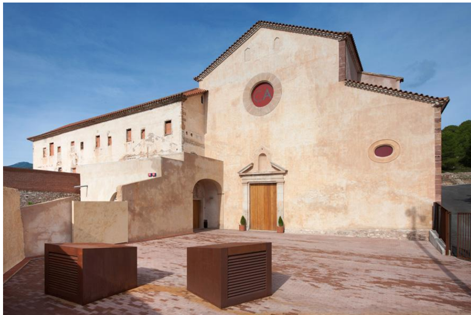
Main facade of the Convent de les Arts

Ajuntament d'Alcover Plaça Nova, 1 43460 Alcover (Alt Camp) CATALUNYA (Spain)