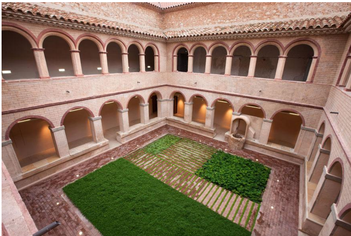
The internal cloister of the Convent de les Arts